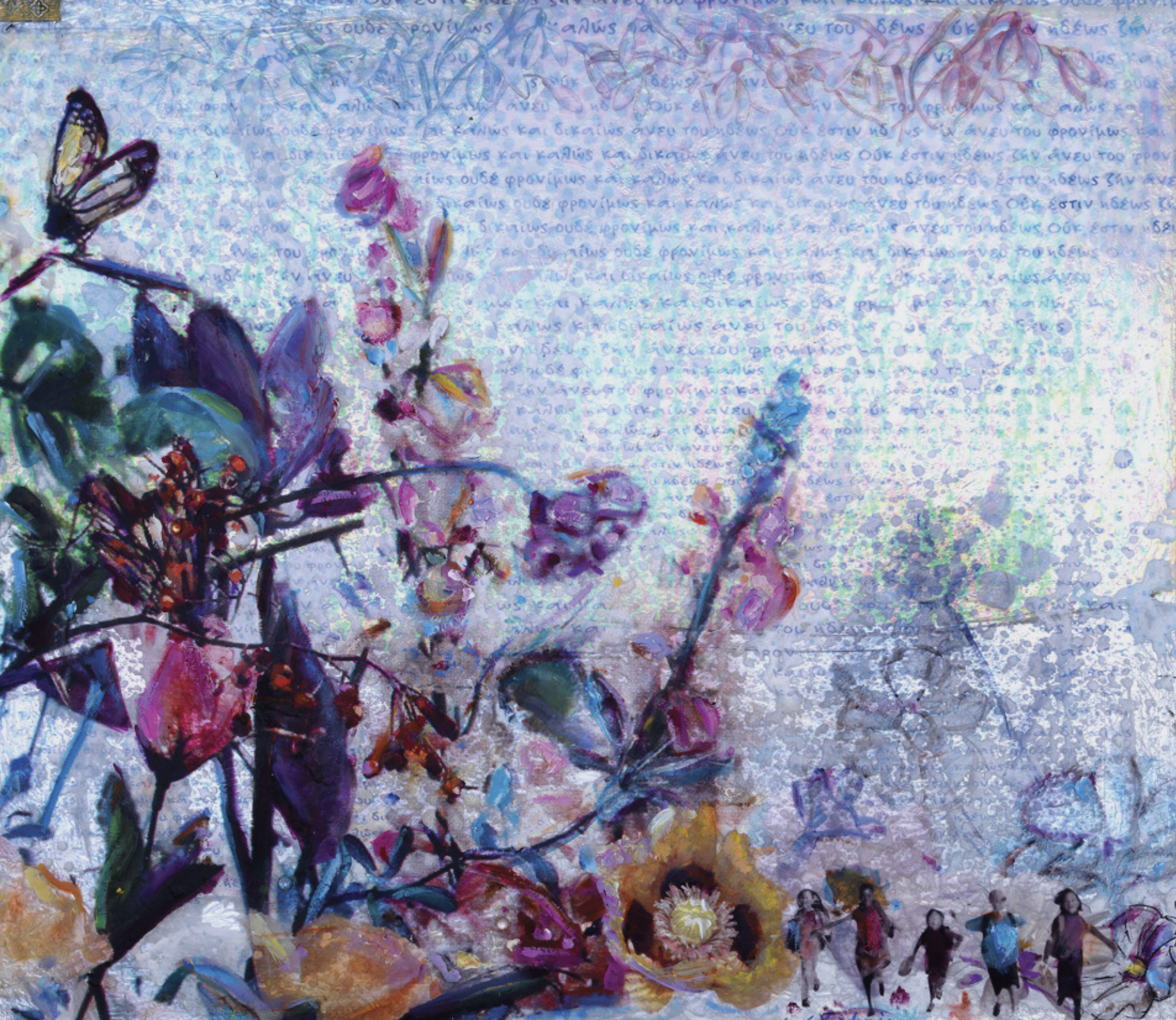
About Felicity , oil on transparencies and metal, 110x135 cm