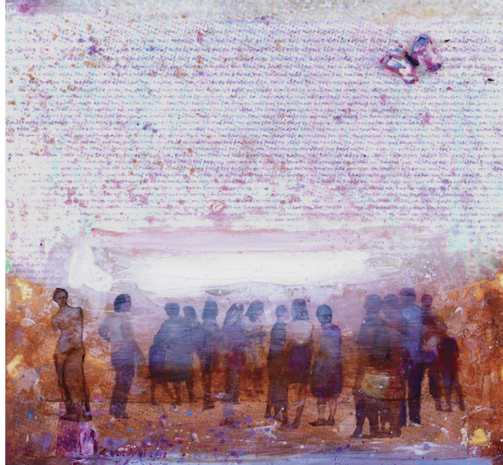
Sweet Dreams, oil on transparencies and metal, 65x70 cm