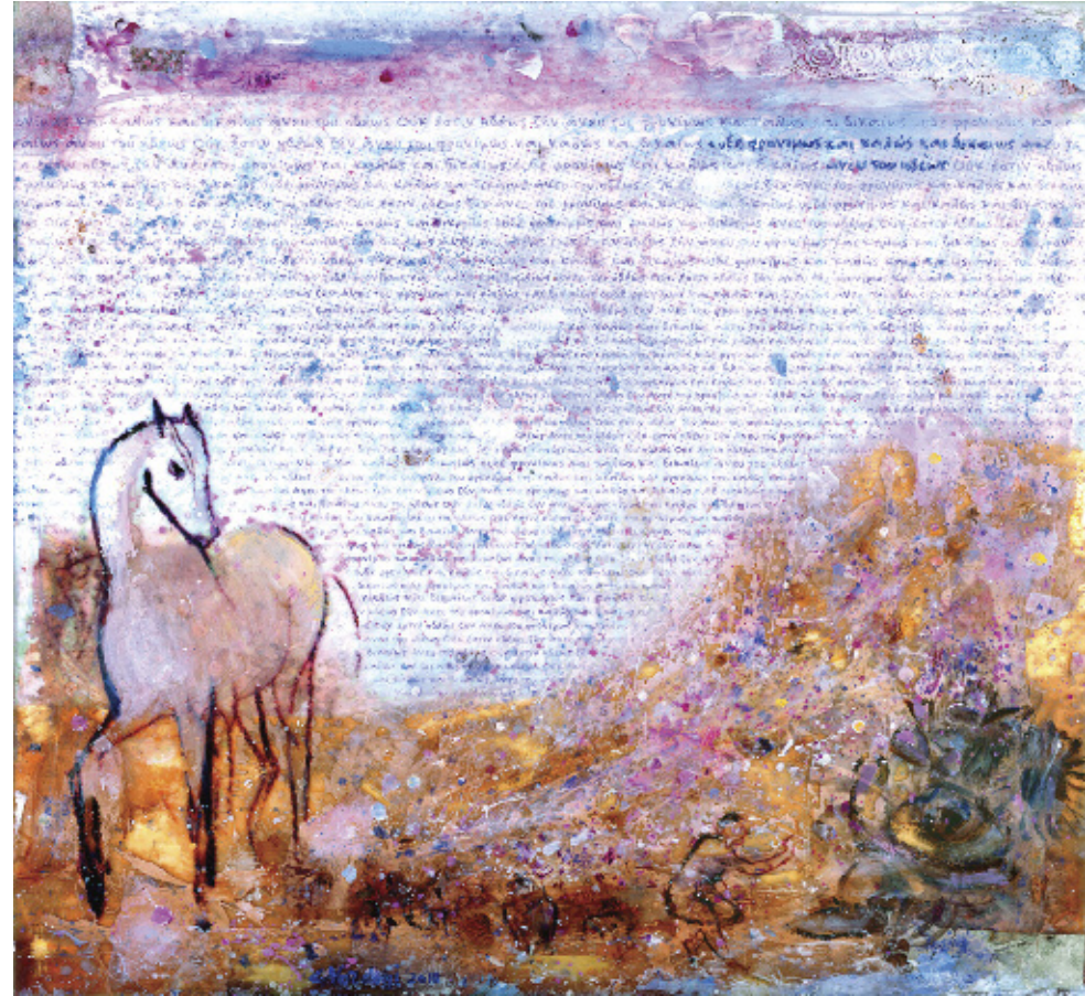
Good Luck, oil on transparencies and metal, 65x70 cm