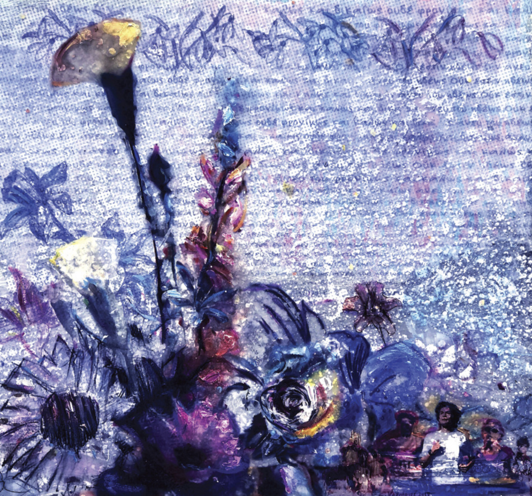
About Felicity , oil on transparencies and metal, 110x135 cm