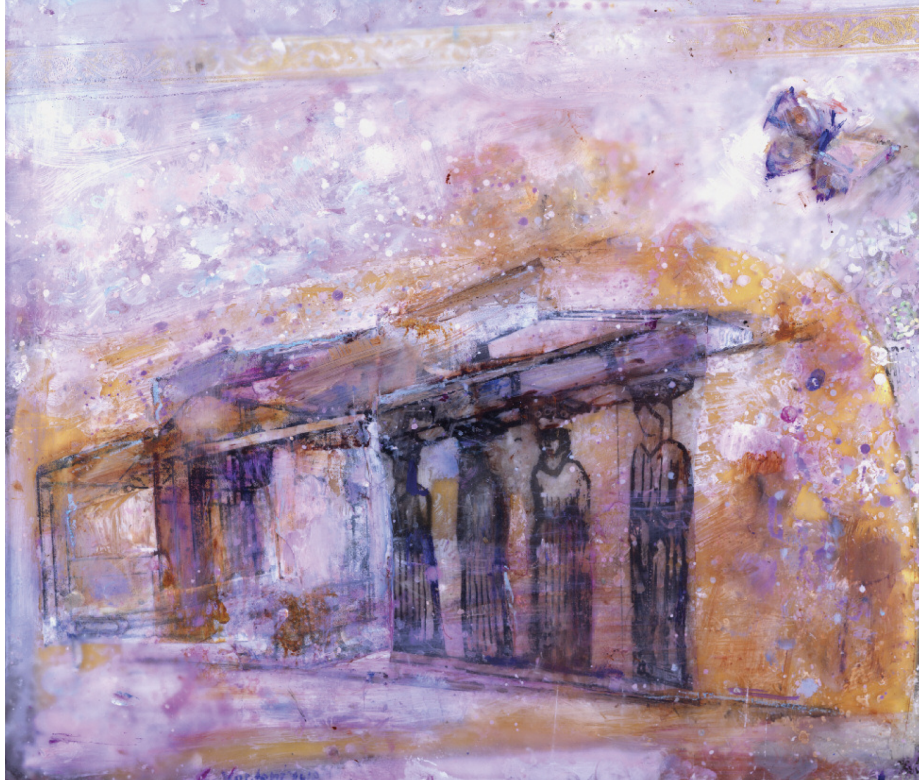
Birth Place , oil on transparencies and metal, 37x42 cm