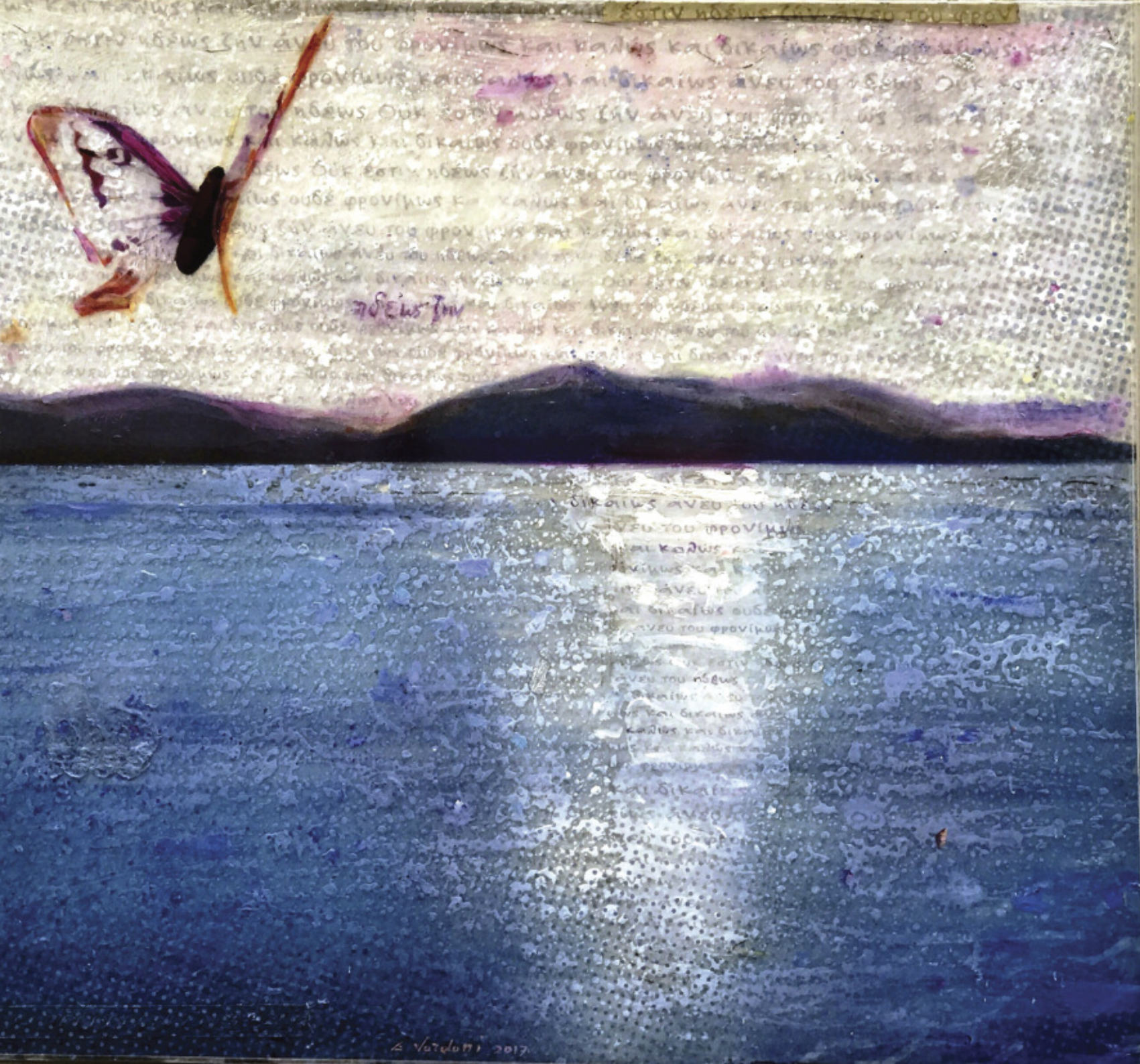
About Felicity, oil on transparencies and metal, 110x135 cm