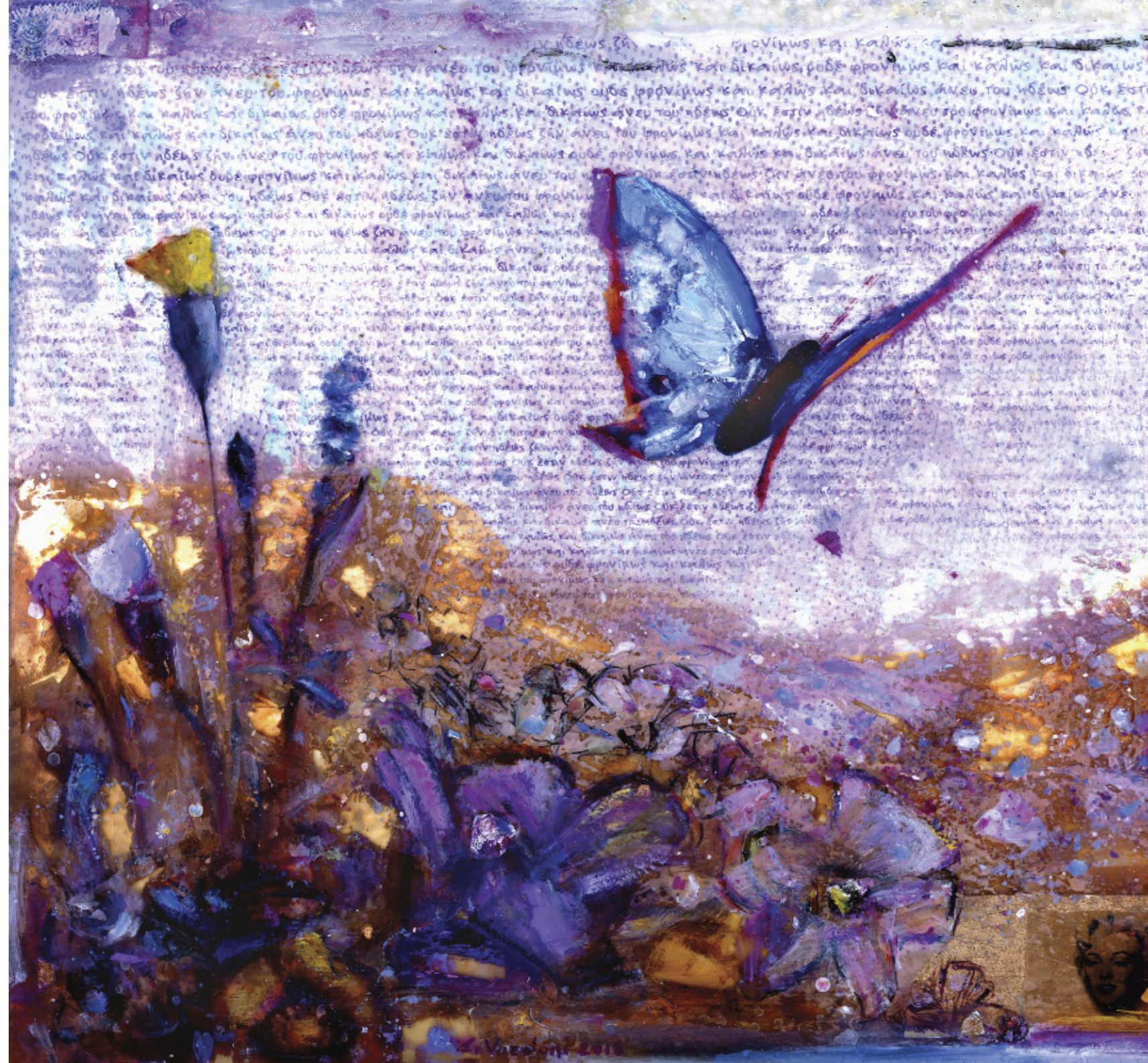
The Butterfly, oil on transparencies and metal, 65x70 cm