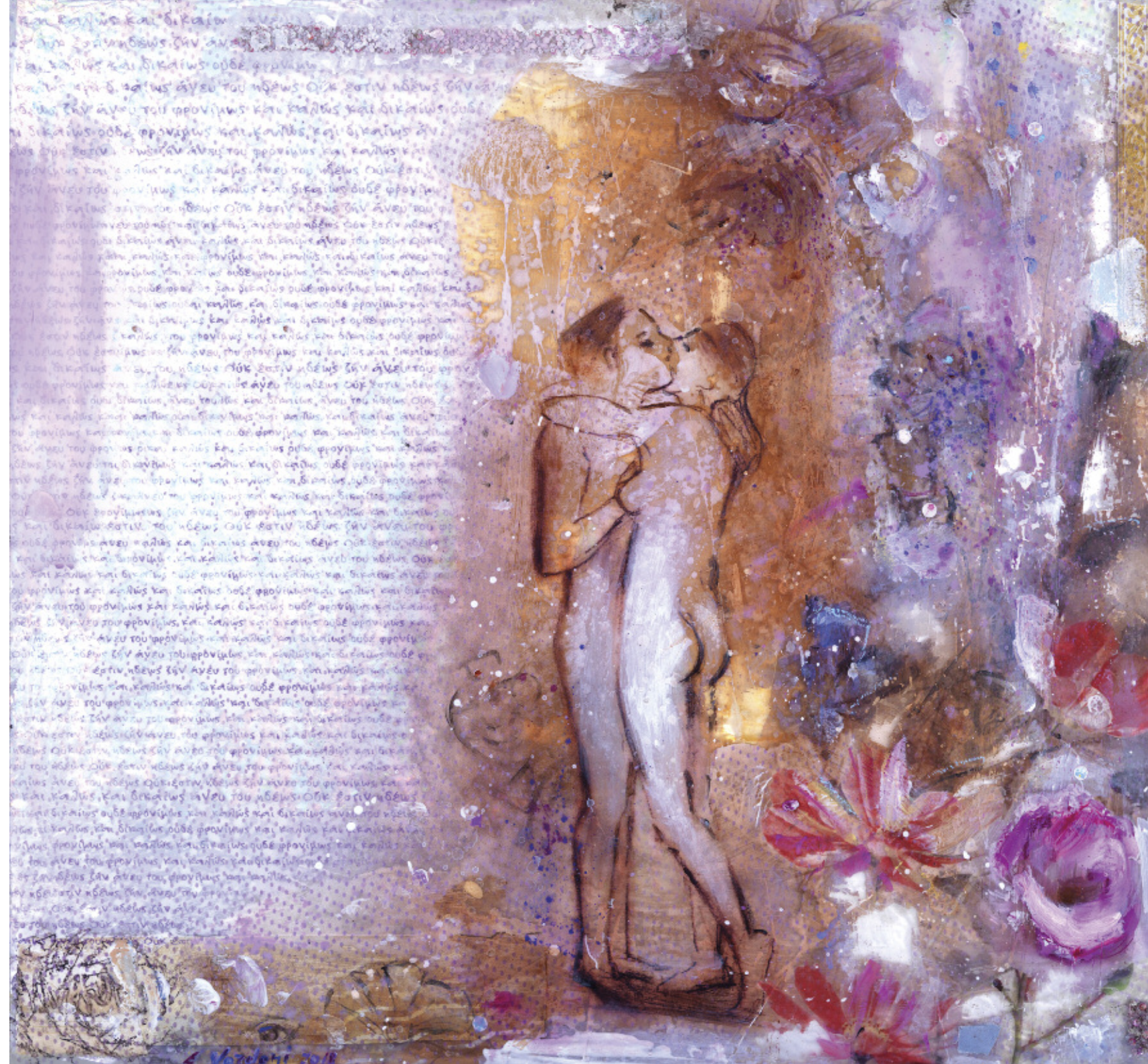
Kismet, oil on transparencies and metal, 65x70 cm