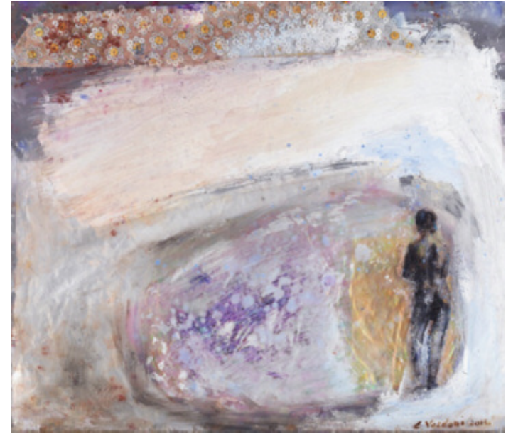
Kismet , oil on transparencies and metal, 37x42 cm